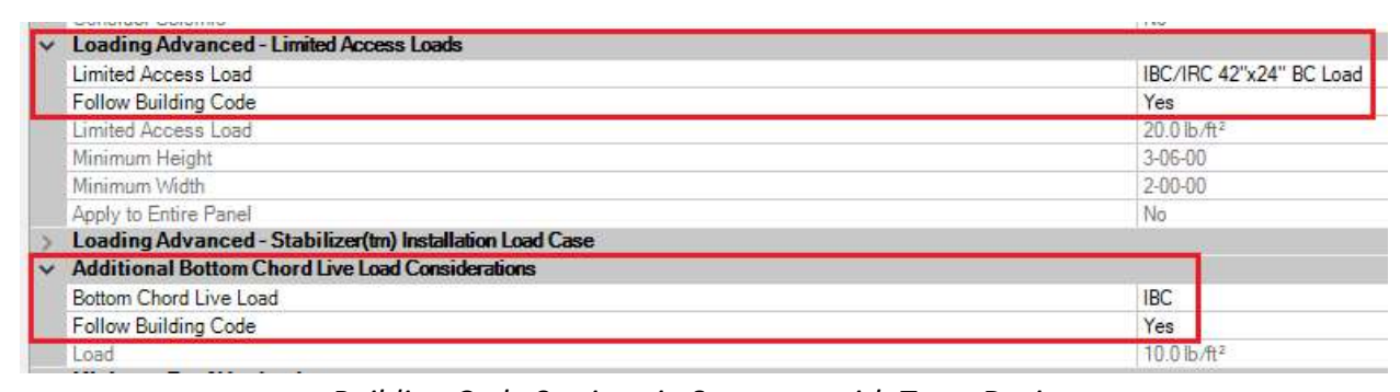
Building Code Settings in Structure with Truss Design