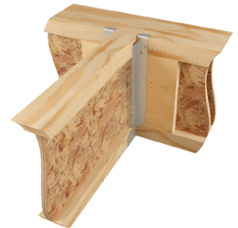
Typical THFI installation