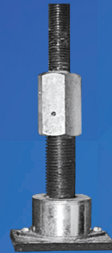
MiTek® Z4™ Tie-Down Systems

Our full line of code-approved, engineered structural connectors, anchors and software solutions backed with robust software selection tool, professional engineering and technical support.